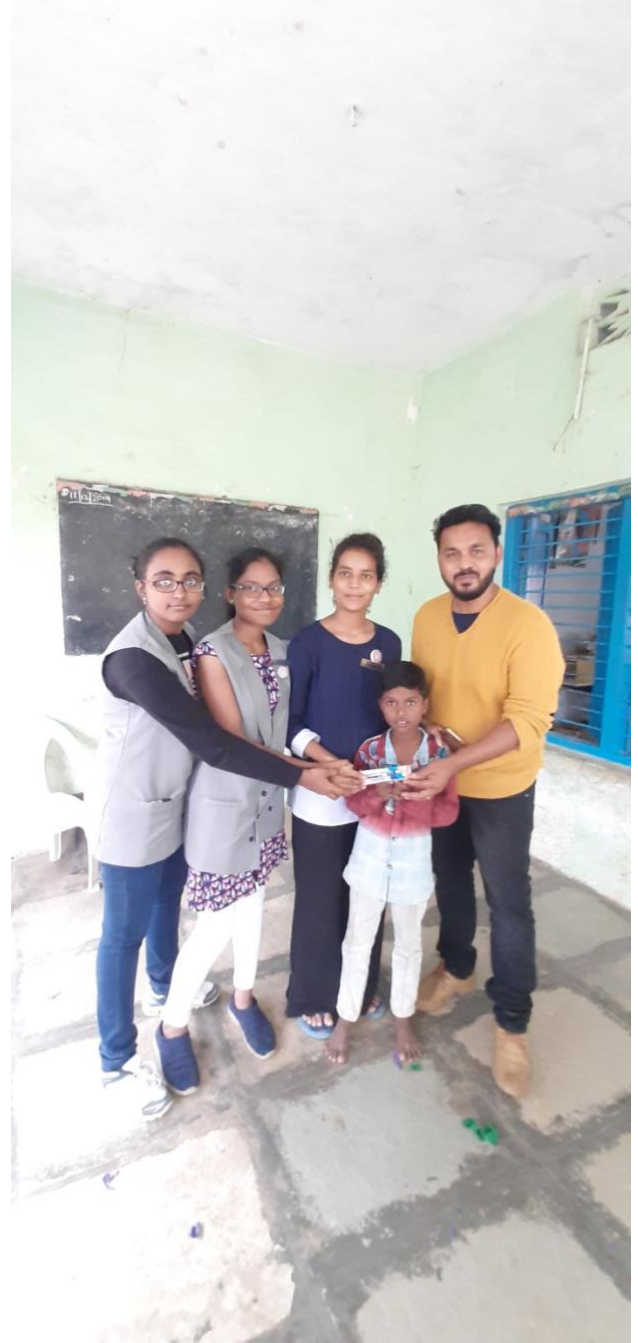
Children were Happy to get Bed sheets and gifts.